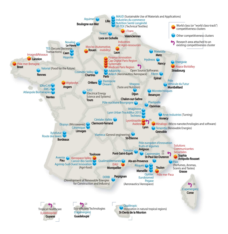
Figure 1: Map competitiveness clusters

(April 2013) For more information about Competitiveness clusters: <a href="https://www.competitivite.gouv.fr/en">www.competitivite.gouv.fr/en</a>